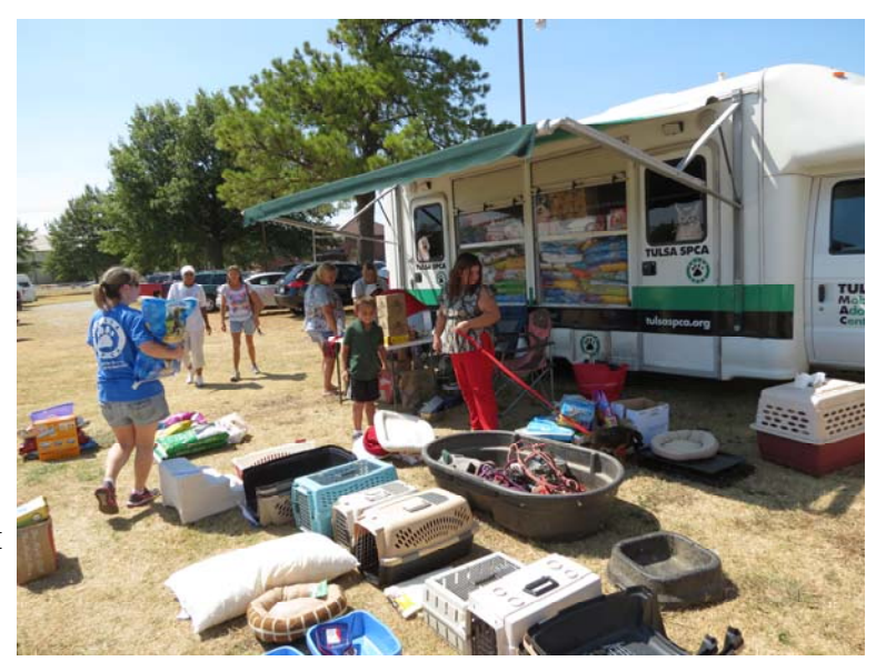
See 'Fires' - continued on page 8

After the donations were sorted, arrangements were made to transport items to areas in need. The MAC traveled to Mannford on August 9 and again on August 17 to distribute items at the food bank parking lot. On August 11 and continuing for the next few weeks, donations were taken to the Olive Baptist Church near Drumright which coordinated relief efforts for domestic animals.