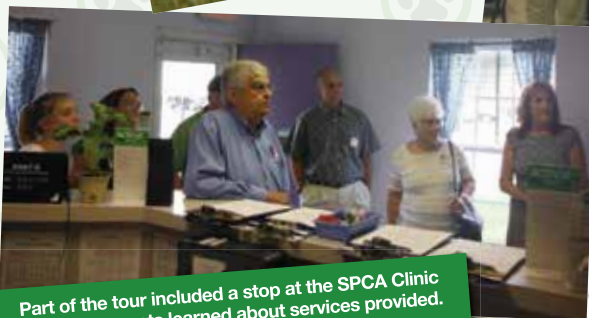
Part of the tour included a stop at the SPCA Clinic where the guests learned about services provided.