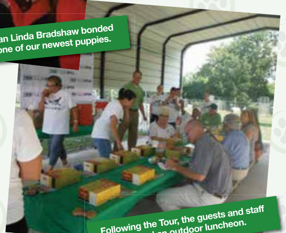
Following the Tour, the guests and staff enjoyed an outdoor luncheon.