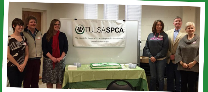
The 2015 Milly Finley Award Winners