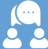
Public Education and Outreach